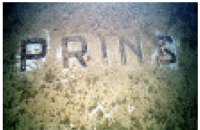
You know who