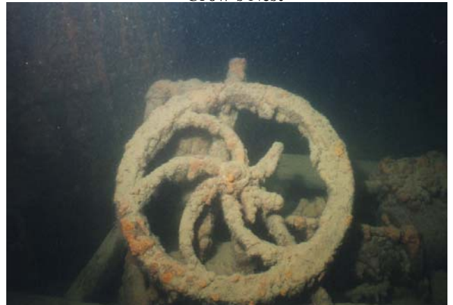
St Albans Pump